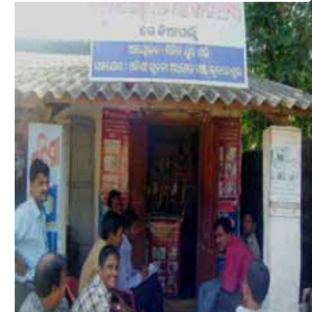
Photographs at a Glance